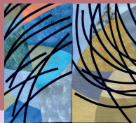
Gabrielle Paquin (FR) 'Design & Graphismes'

The exhibition will show graphics based on scratches and striped textiles. Some works are purely abstract, others stylized figurative.